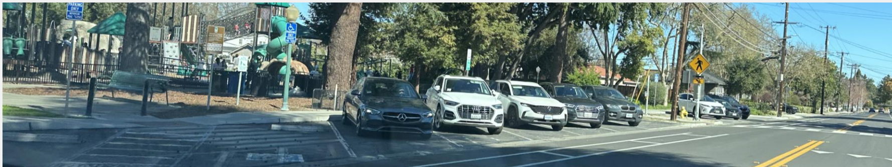
Sunday 3/8 11 a.m.