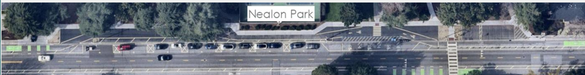
Image: Parallel parking pilot with shifted alignment, Oct 2023