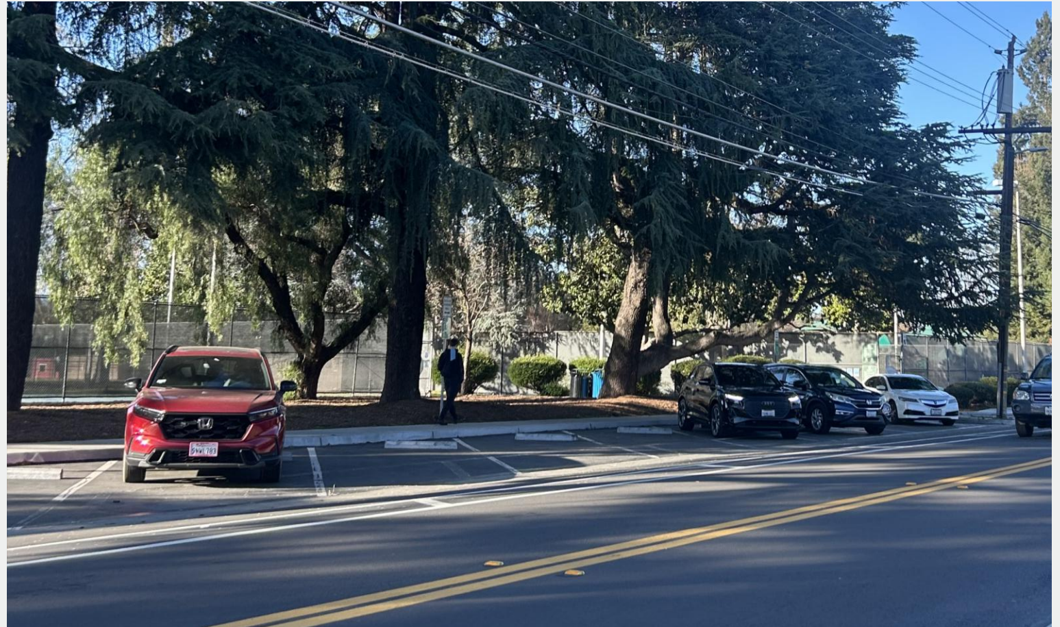
Thursday 3/4 4 p.m.