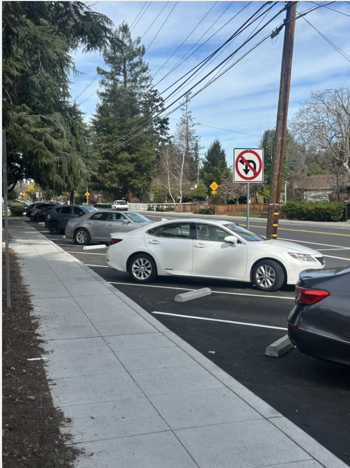
Saturday 2/28 2 p.m.