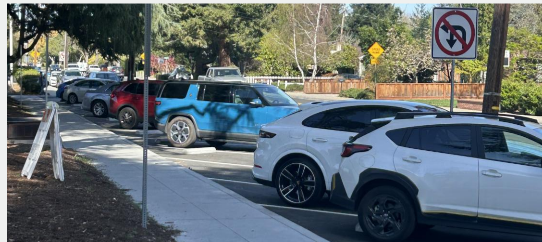
Tuesday 3/10 4 p.m.