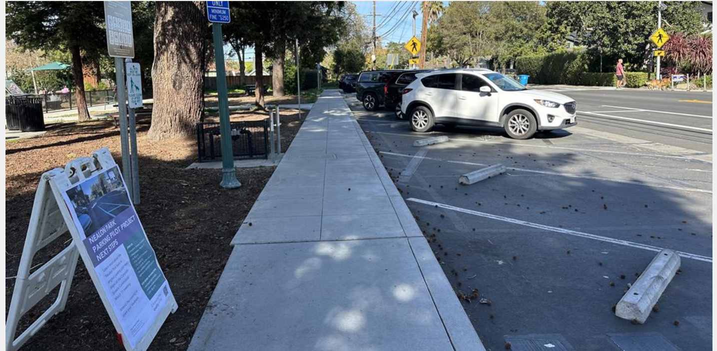
Image: Parking Capacity on Monday 3/9 at 3 p.m.