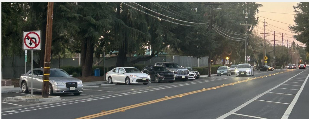
Monday 3/9 7 p.m.