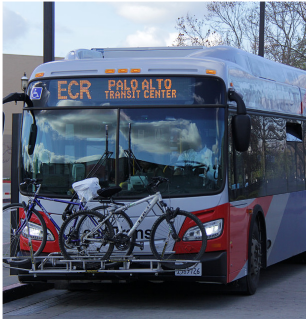
Backbone of the SamTrans system