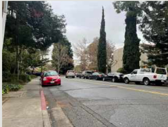
Looking left at 3' beyond the edge of the driveway