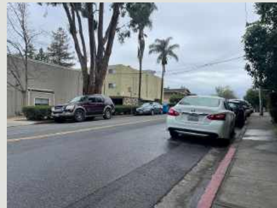
Looking right at 3' beyond the edge of the driveway