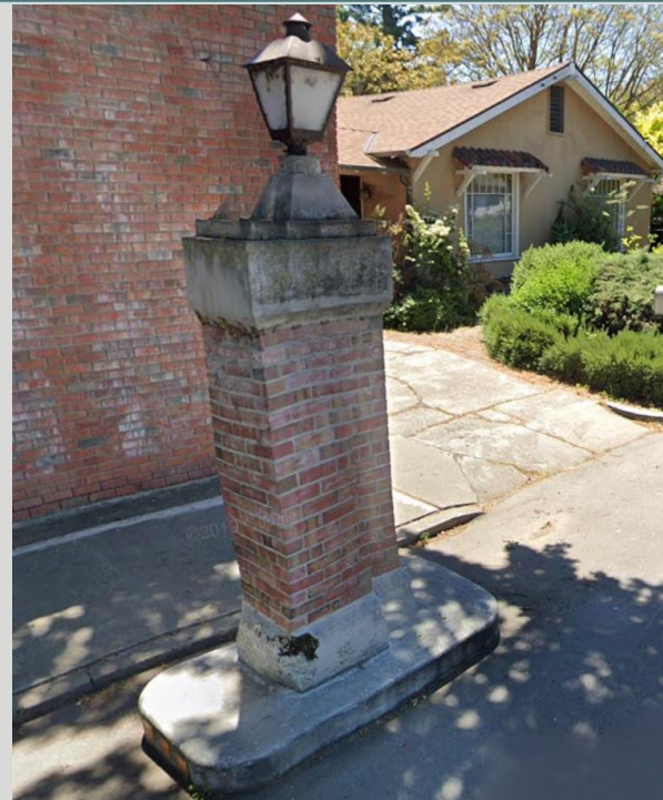
@ Cambridge Avenue