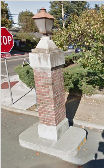
@ Middle Avenue