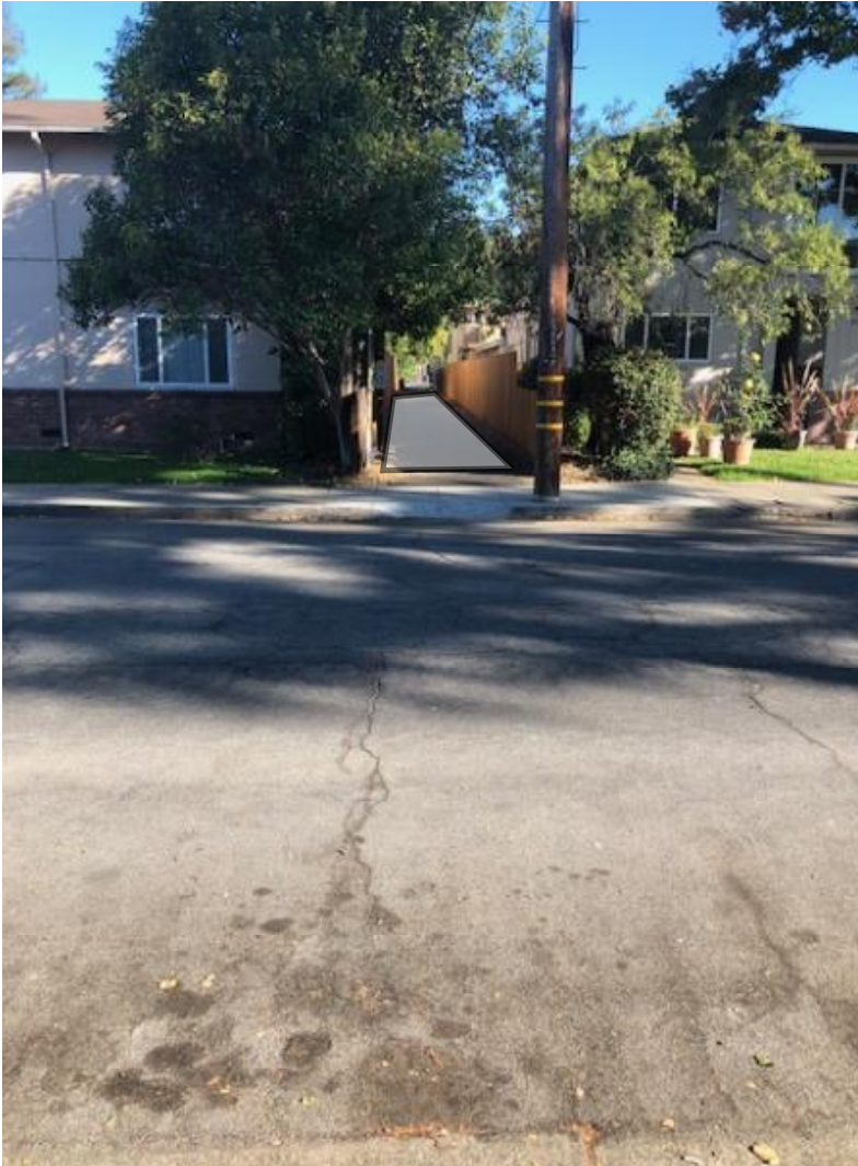
Roble entrance to Nealon existing