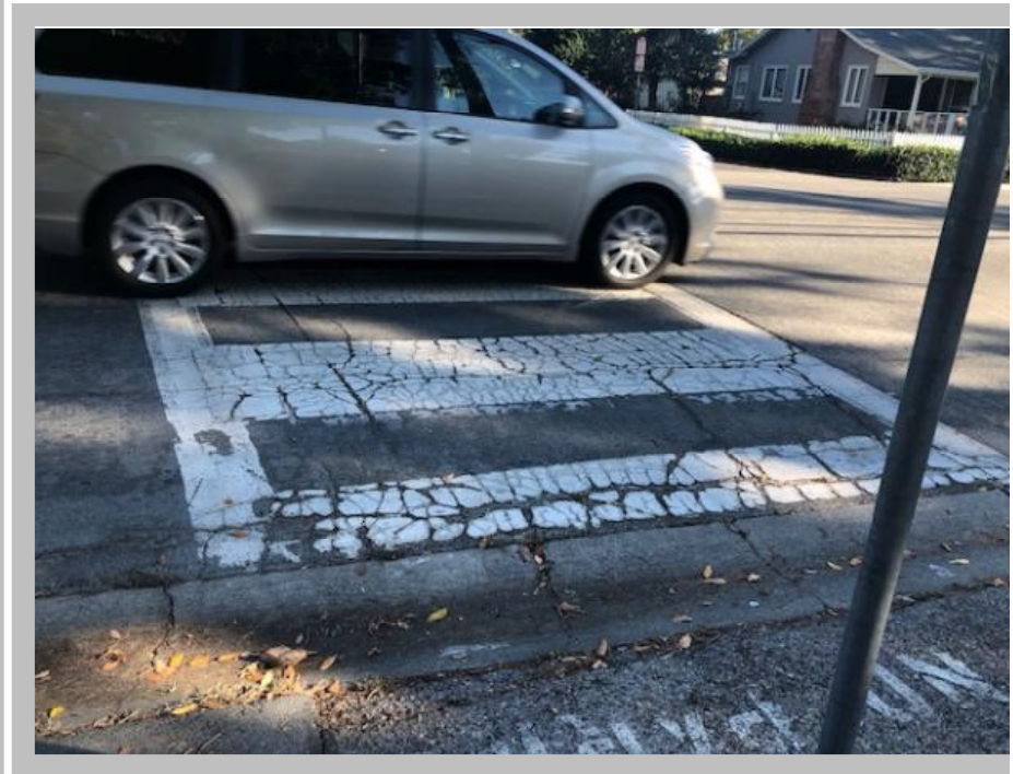
Nealon crosswalk at Blake requires walking through gutte